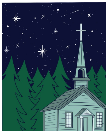
BEYOND CHURCH WALLS

God has a dream for us. It is not necessarily unique but particular to who we the people of the Advent are in contexts of time and place. It is an accounting of sorts, based on how we have been gifted and graced by God. Actually, God is stirring up something in us that is essentially more compelling than a dream, more imperative than an accounting. We are being called to participate in God's great enterprise of bringing in God's kingdom. What is